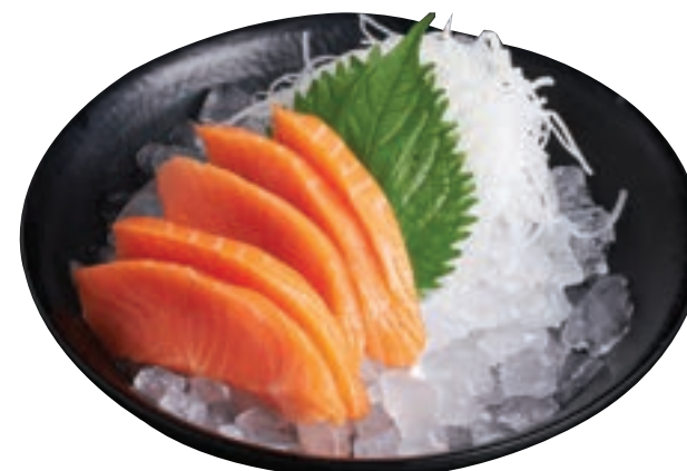
SHAKÉ (New Zealand King Salmon)