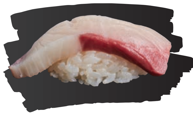
HAMACHI (King Fish)