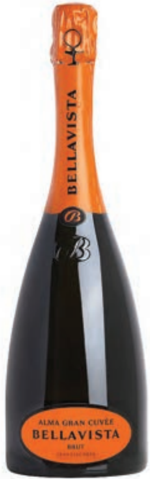
Alma Gran Cuvée 750 ml. THB 6,750