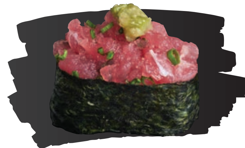
AKAMI (Yellow Fin Tuna & Marui; Pickled Wasabi Shoots)