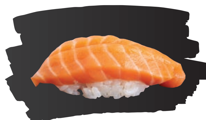
SHAKÉ (New Zealand King Salmon)