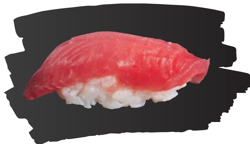
AKAMI (Yellow Fin Tuna)