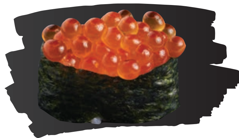
IKURA (Salmon Roe)