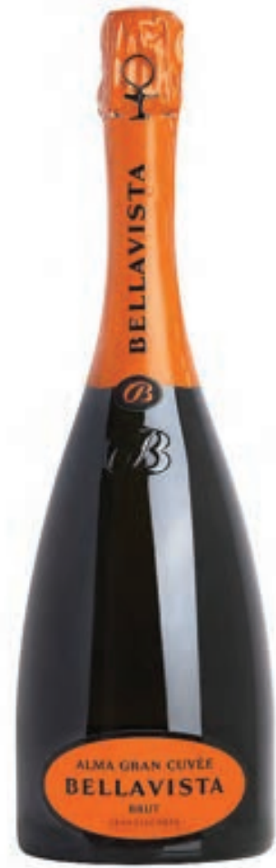
*Alma Gran Cuvée