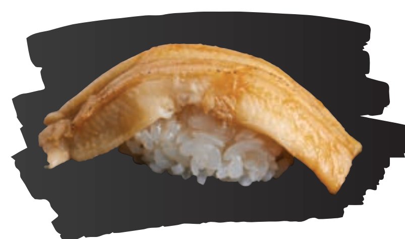
ANAGO (Roasted Sea Eel)