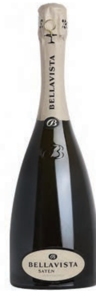
Satèn 750 ml. THB 7,290