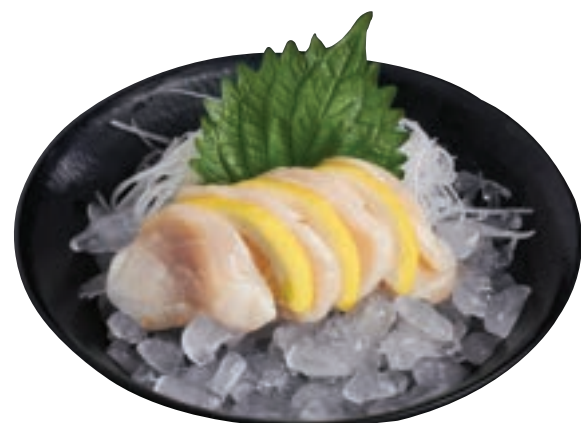
HOTATE (Okinawa Scallop)