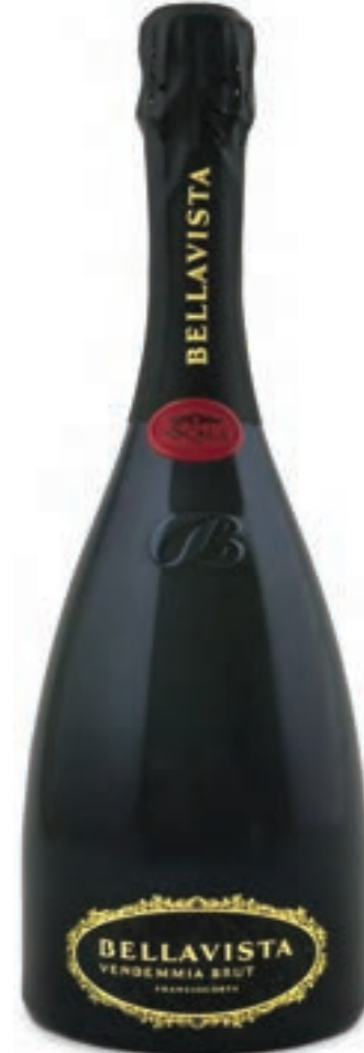
**Teatro Alla La Scala