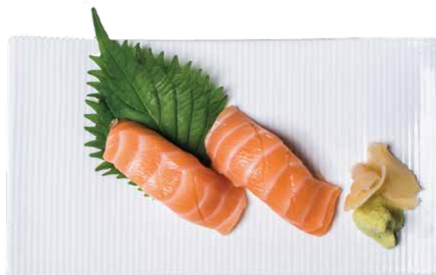
SAKE (salmon) THB 280