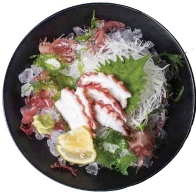
TAKO (octopus) THB 480