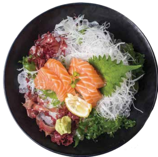
SAKE (salmon) THB 420