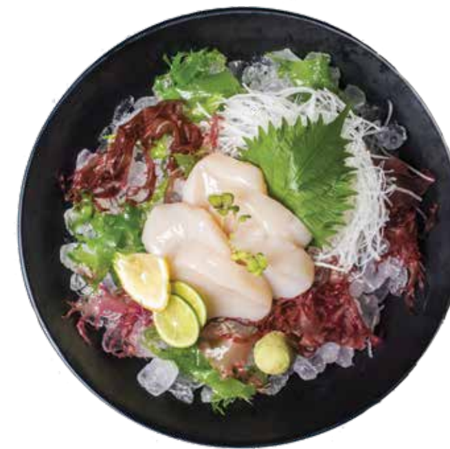
HOTATE (scallop) THB 680