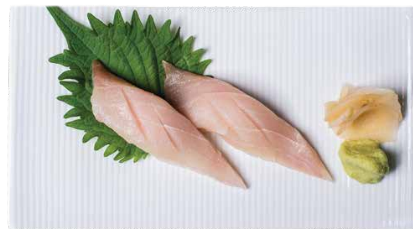
HAMACHI (king fish) THB 395