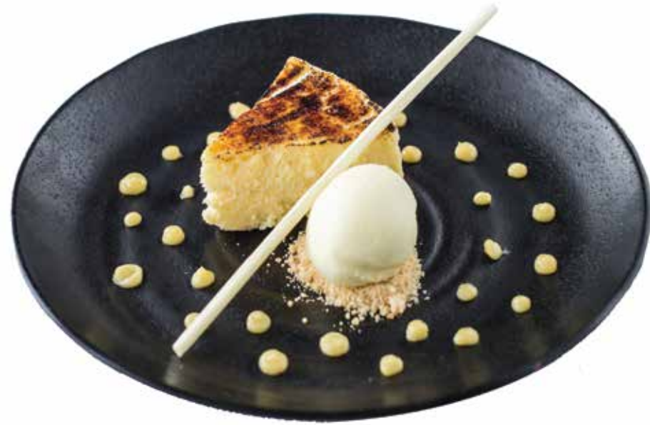
JAPANESE BAKED CHEESECAKE with yuzu cream THB 300