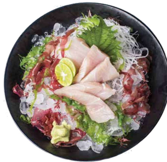
HAMACHI (king fish) THB 550