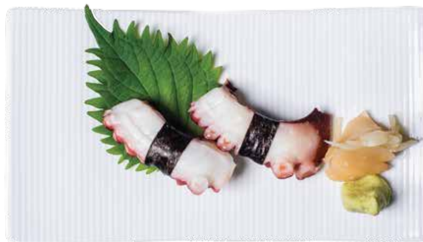
TAKO (octopus) THB 280