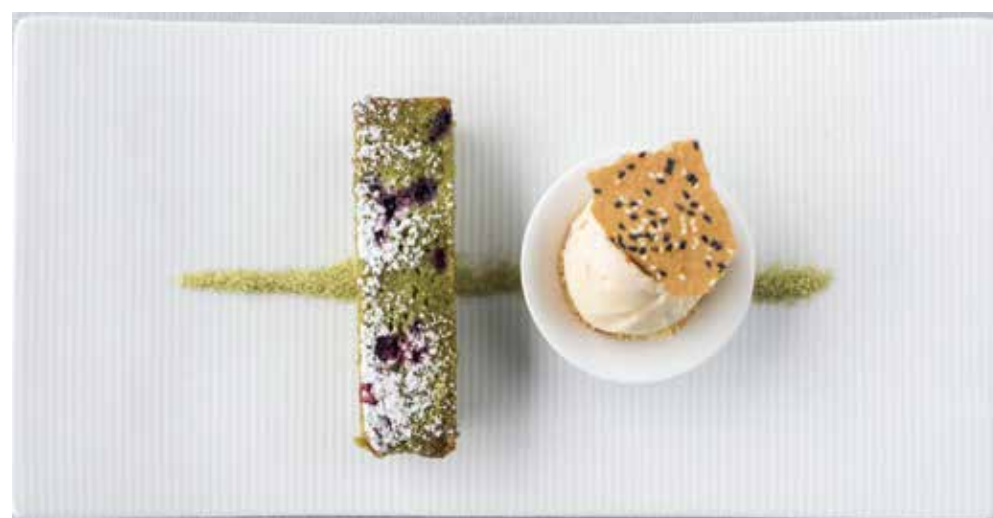
GREEN TEA AND SESAME SLICE with red bean ice cream THB 300