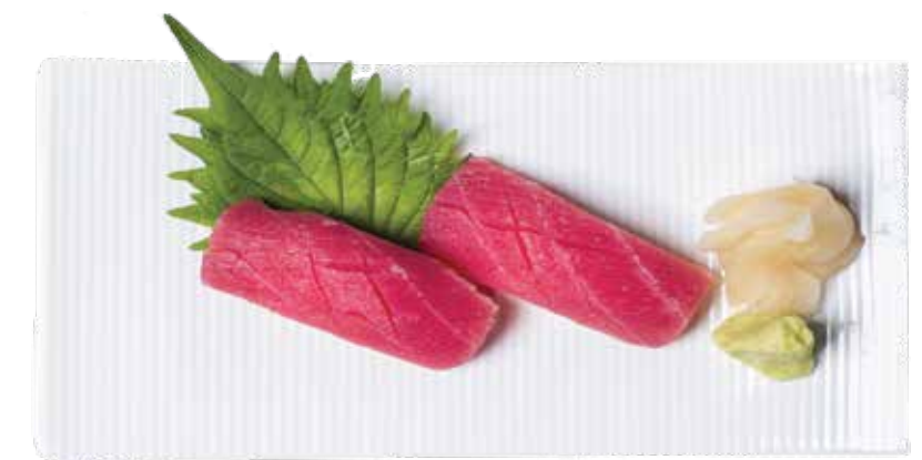
SAKU (tuna) THB 360