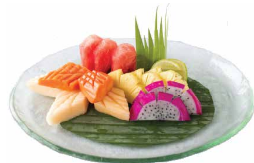
FRESH FRUIT PLATE THB 300