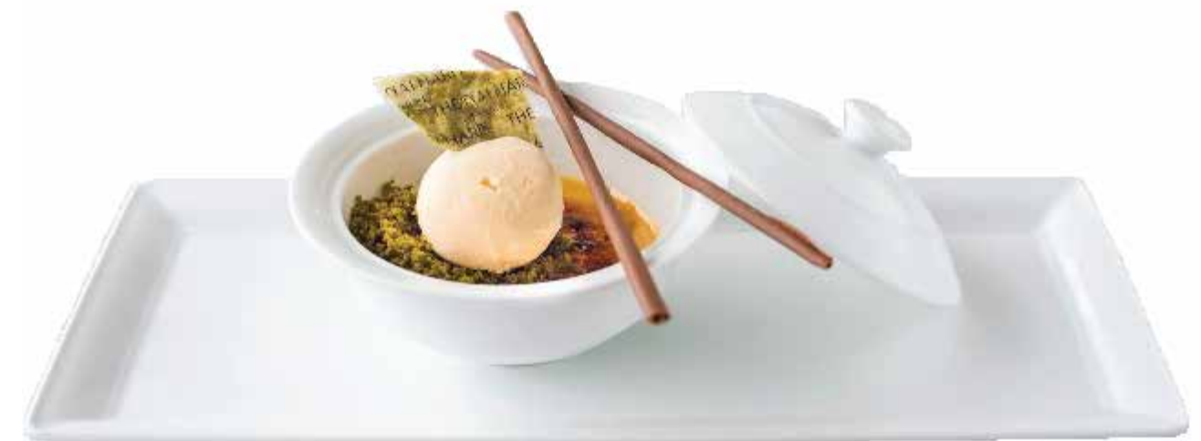
SOY MILK FLAN with Sake Kasu ice cream THB 320