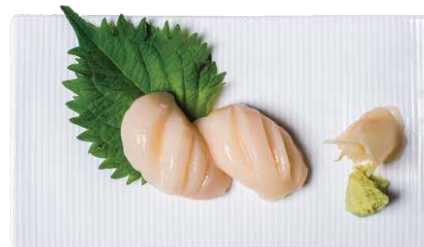
HOTATE (scallop) THB 420