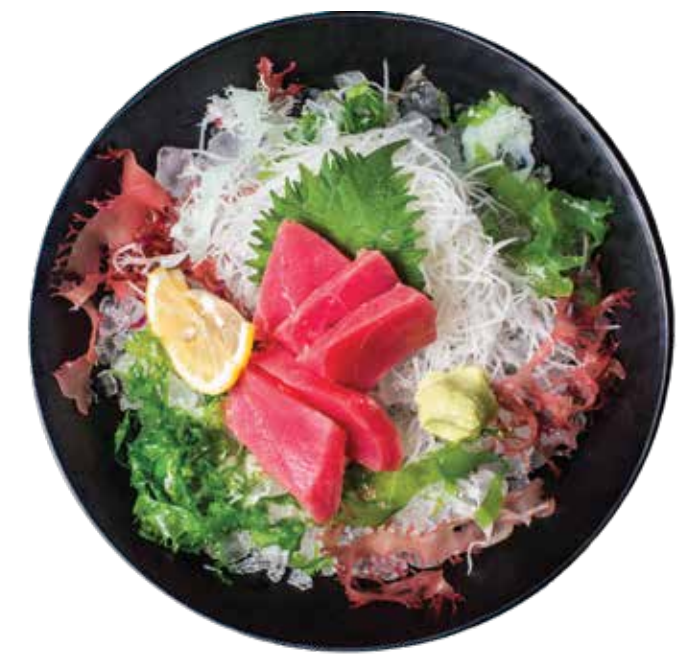
SAKU (tuna) THB 520